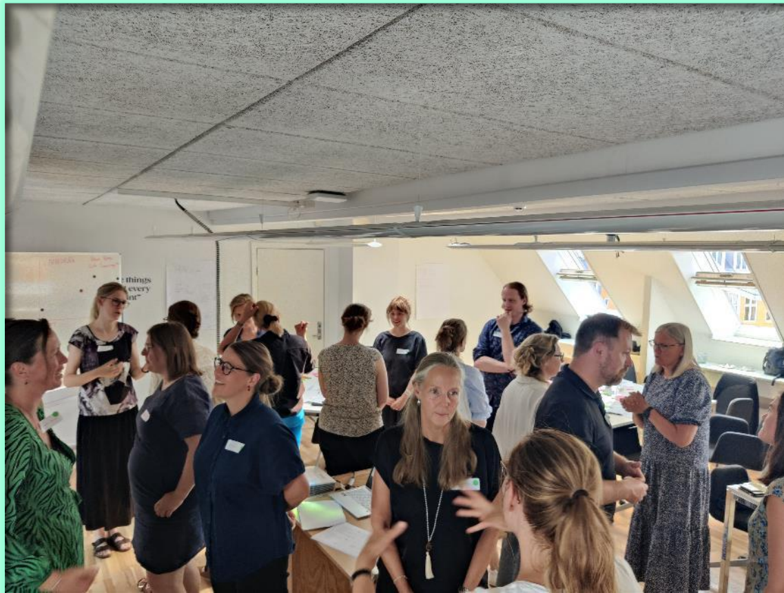
Denmark, June 2023