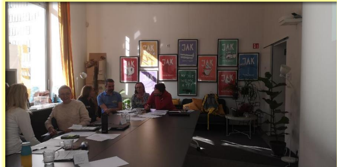
Poland, October 2023